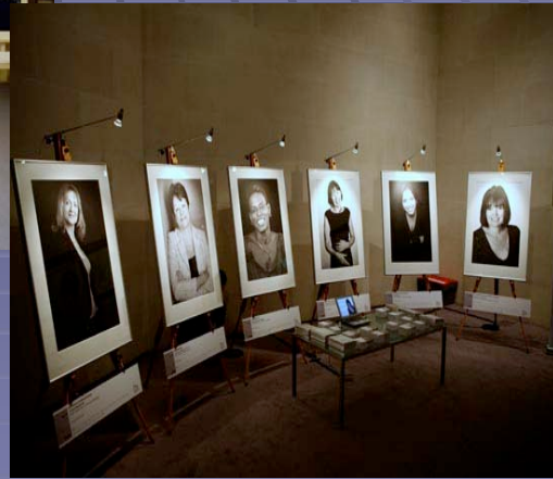
working for inclusion and engagement in science and technology